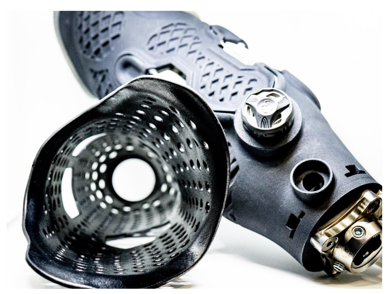
Quatro Prosthetic Sock Inlay - produced out of Lubrizol ESTANE ® 3D TPU with HP Multi Jet Fusion and finished with DyeMansion's VaporFuse Surfacing technology in the Powerfuse S at Rapid 2022 in Detroit

Another big step for VaporFuse Surfacing is the compatibility with Lubrizol's ESTANE ® 3D TPU. This material is characterized by abrasion resistance and high mechanical properties which tend to complicate traditional vapor polishing. DyeMansion has been able to create a new program for their Powerfuse S system -